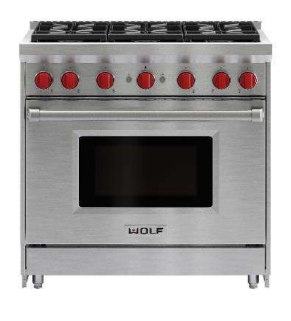
WOLF GR364 36" Gas Range with 4 Burners, Infrared Grill